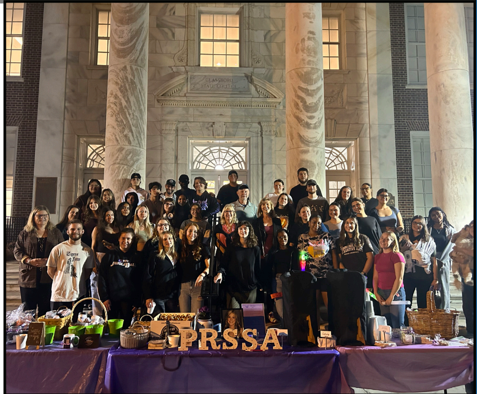
PRSSA Members and Attendees of the 2025 Cystic Fibrosis Walk Away event.