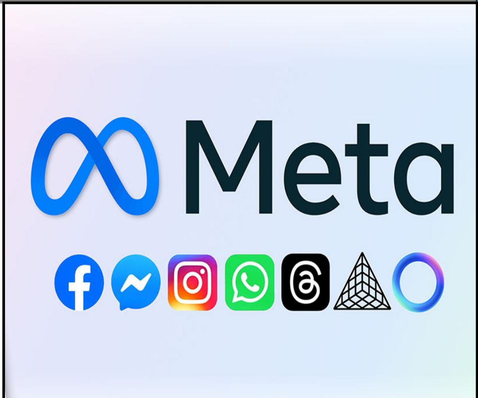
Meta’s logo alongside other Meta-owned platform logos.